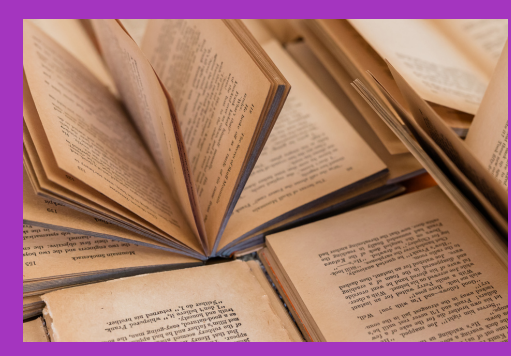
<u>Explore our English</u> <u>Department</u>

Year 9- The Door of No Return Year 9- Things a Bright Girl Can Do Year 9- Poet X Year 10- Crossing the Line Year 10- You Think You Know Me